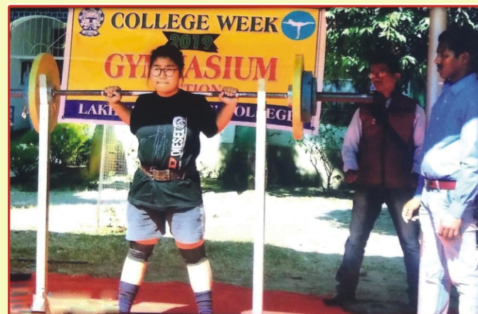
INDOOR SPORTS FAC FACILITES