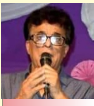
Rtd. Centre Director Dibrugarh Radio Centre 28-06-2019

The ambience of the college is extremely invigorating. I look forward to its further grants and prosperity.